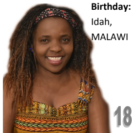
Birthday: Idah, MALAWI